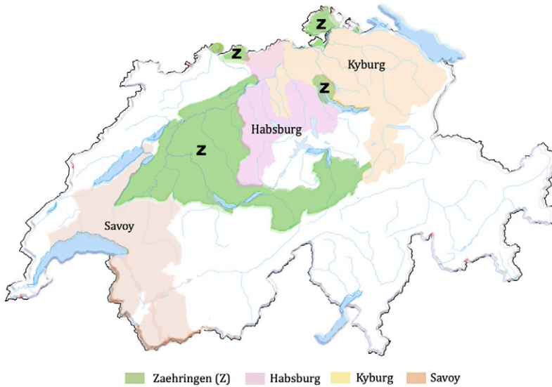
FIGURE 1.—Location of the Noble Dynasties in Medieval Switzerland. Notes. The map shows areas under the rule of different noble dynasties in Switzerland before the Zaehringen extinction.

a privileged political status of “imperial immediacy.” 3 Though still subjected to the fiscal, military, and hospitality demands of the emperor, the imperial fiefs were now free from the authority of nobles and their citizens could participate in decision-making. In contrast, the Zaehringen private fiefs were divided between the surviving family members, and like fiefs under the rule of other dynasties, remained under nobility.