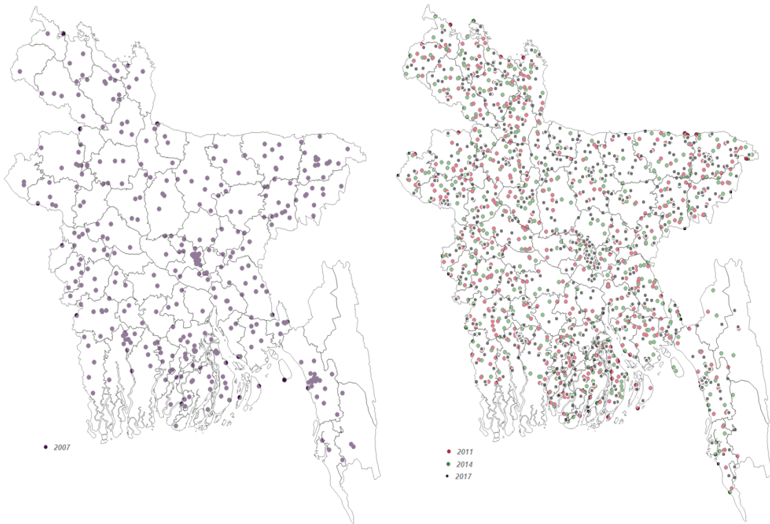
Figure 1: Location of BDHS clusters

Notes: Figure 1 shows the location of all BDHS clusters in our sample for 2007 (on the left), and for 2011, 2014 and 2017 (on the right).